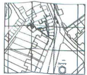
LOCATION DIAGRAM @ 1:1250 scale

LASER SURVEYS LASER AND ELECTRONIC SURVEYS, LANDSCAPE ARCHITECTURE, SURVEYING, CIVIL ENGINEERING Established 1978, Member of the Survey Association 14 & 14A YORK HILL, LOUGHTON, ESSEX, IG10 1RL Tel: 0206 850000 Fax: 0206 850001 www.lasersurveys.co.uk