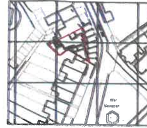
LOCATION DIAGRAM @1:1250 scale

LASER SURVEYS Laser scanning technology provides a fast and accurate method of capturing 3D data. The resulting point cloud can be used to create a highly detailed and accurate 3D model of the scanned object or area. This data can be used for a wide range of applications, including building information modelling (BIM), infrastructure management, and heritage recording.